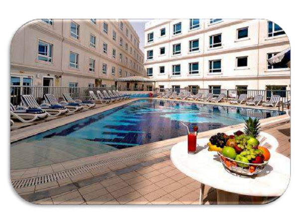
Accessible Swimming Pool