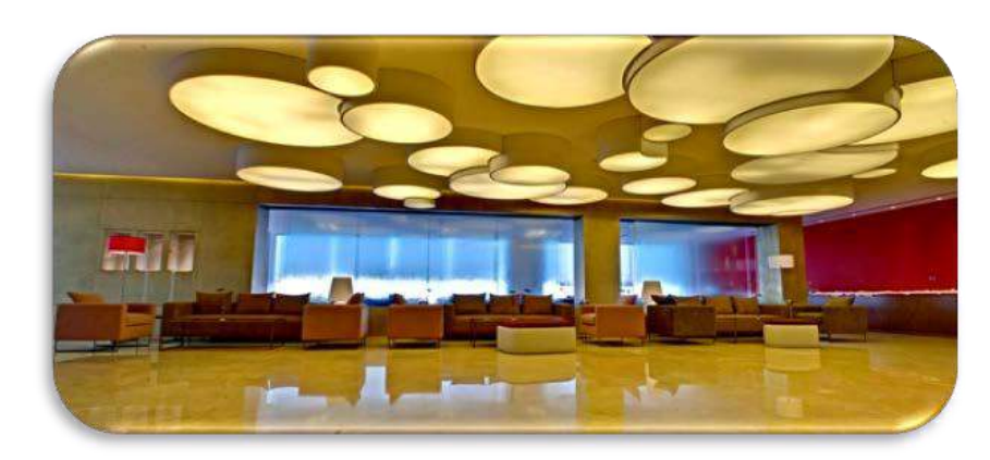
Free Internet in the Lobby